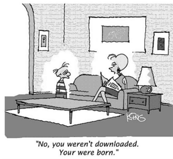
Figura 1. A typical figure